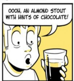
If you have too much you'll get a HEADACHE