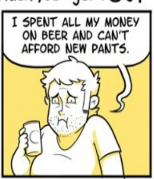
but it doesn't really matter because