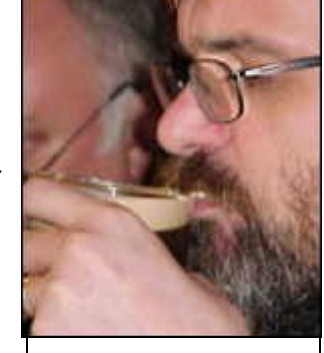
A full beard will cost a stout drinker £23 annually

The star of BBC Northern Ireland's "Hole in the Wall Gang" comedy show believes that a profession in which research into the undiscovered dimensions of his favoured tipple would be an ideal way to earn a living.