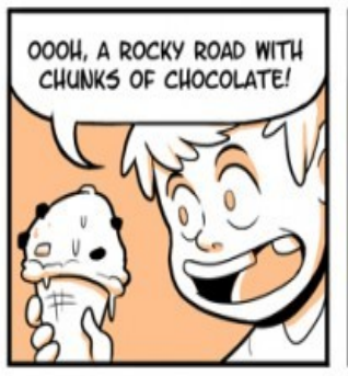
There are TONS of varieties