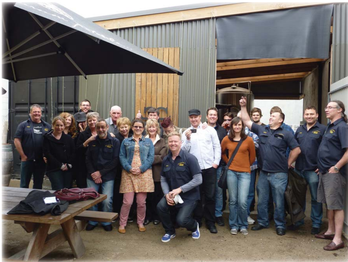
Happy Westgaters with family and friends!