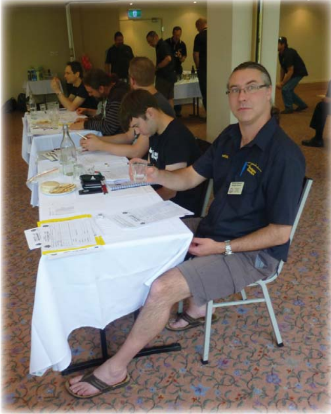
Great clarity on this one!