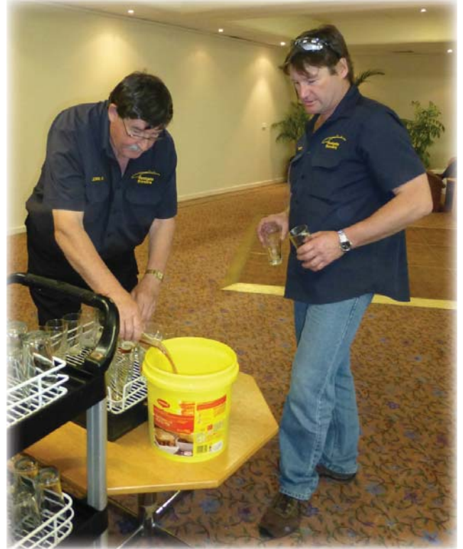
Here ya go Tabby, you try it first