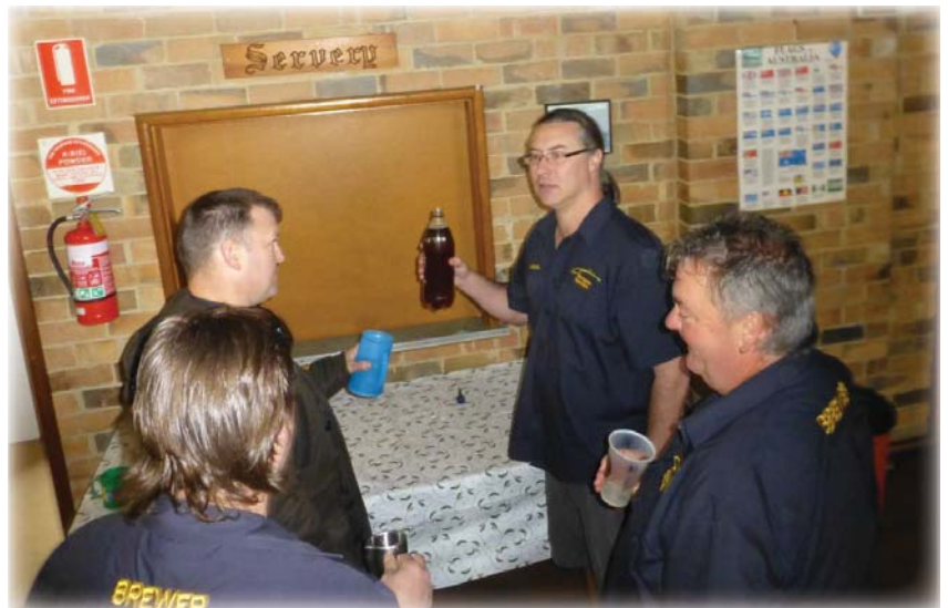
Please sir, can we have some more?