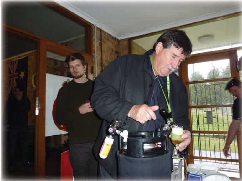
Mr President getting things kick started!