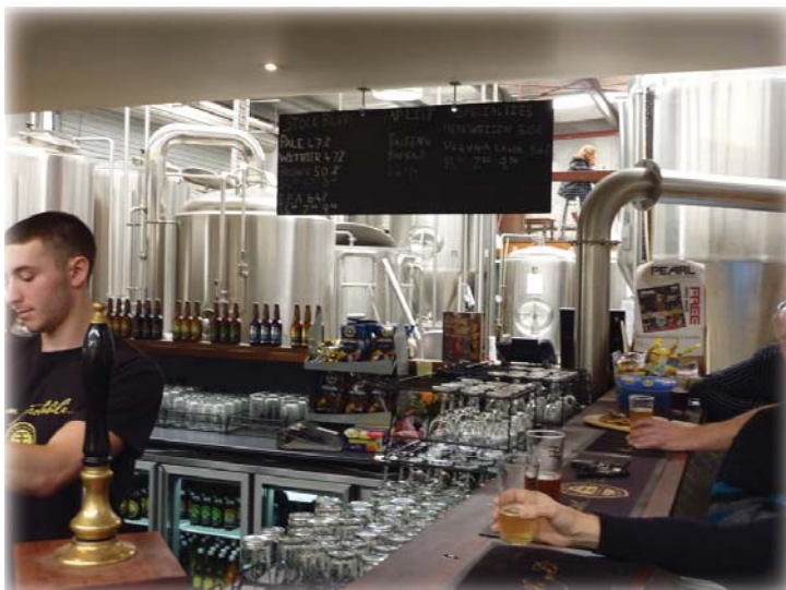
Beer and shiny stainless @ Mornington Peninsula Brewery